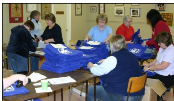
Thank you bags mailout working bee