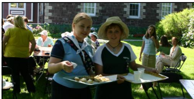
Lieutenant Governor's Garden Party