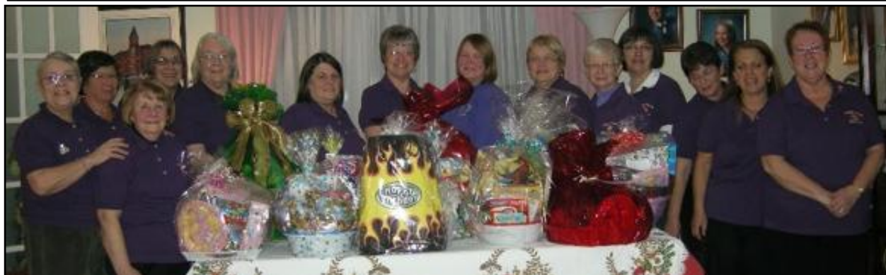
Members of the Fireside Friends Trefoil Guild gathered around some of the baskets that they put together to benefit needy families through the Food Sharing Association under the Guiding's National Eradicate Hunger and Poverty Challenge.