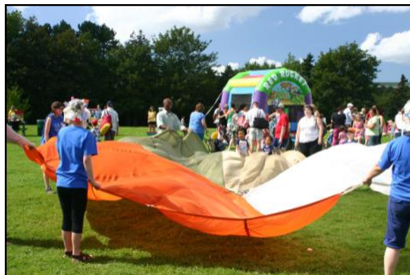
Family Day at Bowring Park