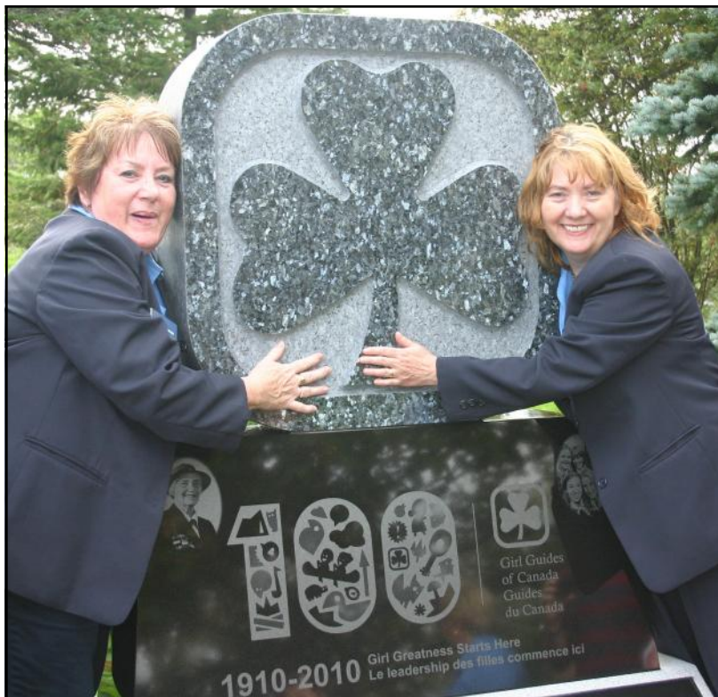
100th Anniversary Monument Unveiling at Bowring Park