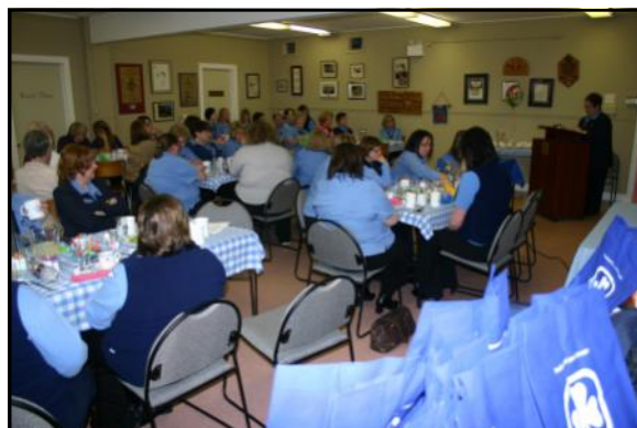
BP Brunch at Girl Guide Headquarters