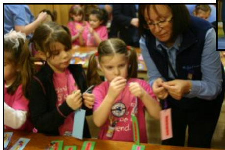
100th Anniversary Rally Day